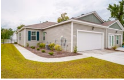
Ascend Carolina Forest 48 Homes | Myrtle Beach SC SALE & FINANCING