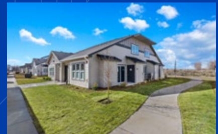
Amazon Falls 184 Homes | Eagle ID BRIDGE REFINANCING