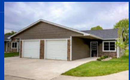
Villas at Deerwood 47 Homes | Huxley IA FANNIE MAE REFINANCING