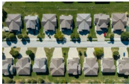
Flint Meadows Land ±27 AC | De Soto KS SALE