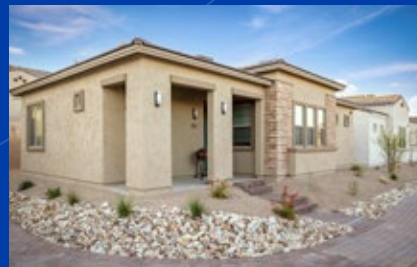
The Havenly Fountain Hills 147 Homes | Fountain Hills AZ LIFE COMPANY FINANCING