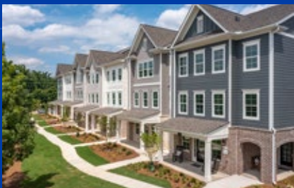
Sweetwater Springs 58 Homes | Lawrenceville GA FANNIE MAE FINANCING