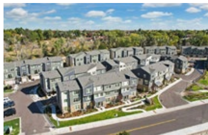
AVERE on the High Line 56 Homes | Denver CO SALE