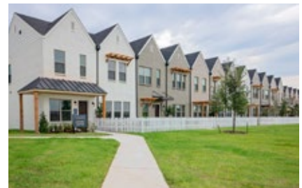
Townhomes at Bluebonnet Trails 114 Homes | Waxahachie TX SALE & FREDDIE MAC FINANCING