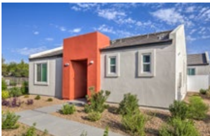
Moderne at Centennial 185 Homes | Las Vegas NV SALE & CONSTRUCTION FINANCING