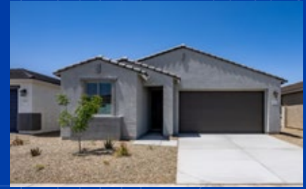
The Orchards on 12th 38 Homes | Phoenix AZ SALE