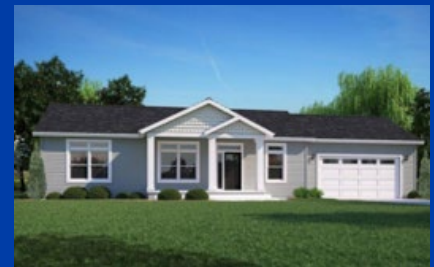
Oak Creek Village 47 Homes | Oak Creek WI CONSTRUCTION FINANCING