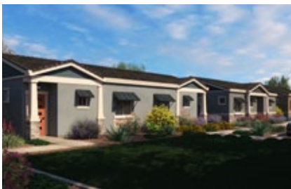
Allero 94 Land ±8 AC | Phoenix AZ SALE