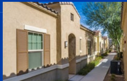
Villas at Chandler Heights 116 Homes | Chandler AZ LIFE COMPANY FINANCING