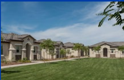
TerraLane at Canyon Trails 262 Homes | Goodyear AZ SALE