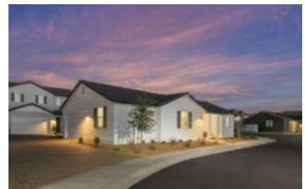
Cyrene at South Mountain 72 Homes | Phoenix AZ SALE