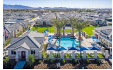
CTC at Estrella Commons 286 Homes | Goodyear AZ SALE & FANNIE MAE FINANCING