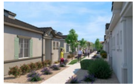
Honeycutt Run 209 Homes | Maricopa AZ SALE & CONSTRUCTION FINANCING