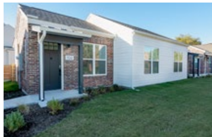
ParcHAUS at Skyline 136 Homes | McKinney TX SALE & ACQUISITION FINANCING