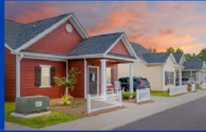
Jasper Village 208 Homes | Rincon GA SALE