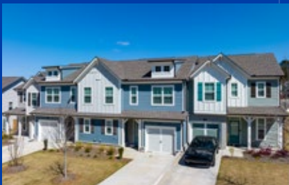
Brighton Townhomes 40 Homes | Acworth GA CONSTRUCTION FINANCING