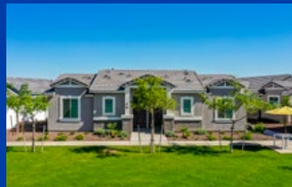
TerraLane at South Mountain 147 Homes | Laveen AZ SALE