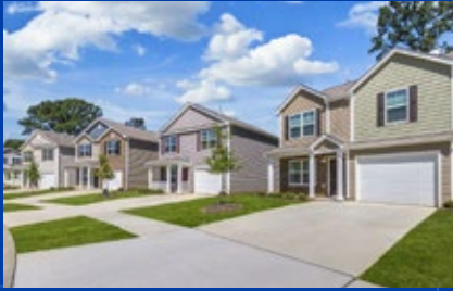
Harrison Trace 84 Homes | Charlotte NC SALE