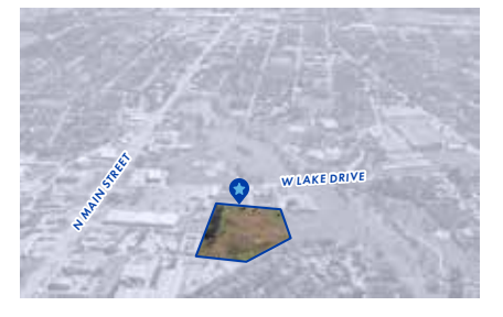
Taylor Development Site Multifamily/BTR, raw land ±4.0 AC TAYLOR, TX