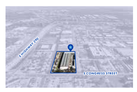
4201 S. Congress Mixed-use redevelopment ±5.52 AC AUSTIN, TX