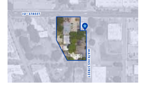
10<sup>th</sup> St & Watkins St Assemblage Urban high-rise mixed-use ±1.3 AC ATLANTA, GA