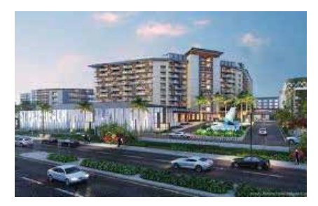
Vela Channelside Phase I Urban high-rise mixed-use ±1.53 AC TAMPA, FL