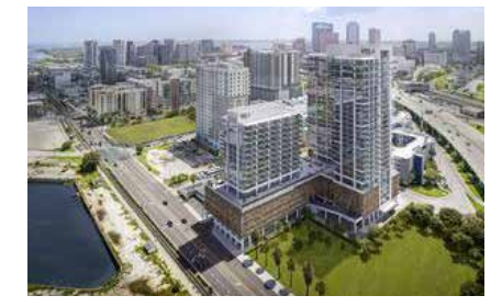
Vela Channelside Phase II Urban high-rise raw land ±0.67 AC TAMPA, FL