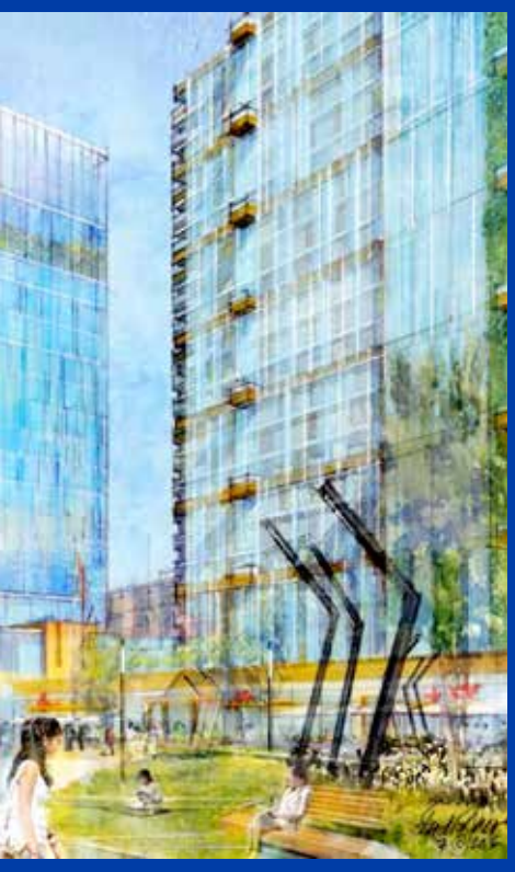
Conceptual drawing of Project Catalyst, showing a street view

We brought in Stantec's Urban Places Group out of Boston, a specialty design team that works solely on large-scale infill mixed-use environments. We also consulted with a renowned land use attorney in Austin. Using these consultants, we designed an environment that suggested of mixeduse buildings and an average height limit of 90 feet throughout.