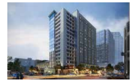
Hyatt Place & Hyatt House Dual-branded hotel development ±1.01 AC TAMPA, FL