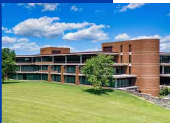
ABOVE Former site of McDonald's global headquarters situated on ±48 acres.

McDonald's Corporation JPD Oak Brook Holdings