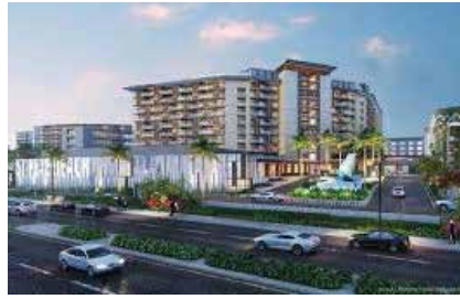
Vela Channelside Phase I Urban high-rise mixed-use ±1.53 AC TAMPA, FL