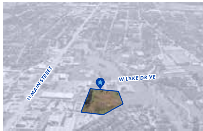
Taylor Development Site Multifamily/BTR, raw land ±4.0 AC TAYLOR, TX