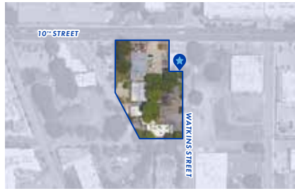
10th St & Watkins St Assemblage Urban high-rise mixed-use ±1.3 AC ATLANTA, GA