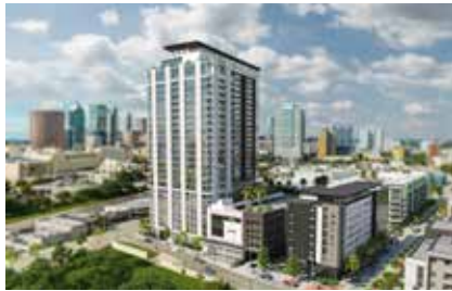
Encore, Lot 10 BTR/Mixed-use, raw land ±1.96 AC TAMPA, FL