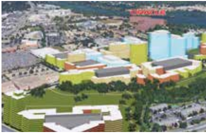
Project Catalyst Mixed-use redevelopment ±97.0 AC AUSTIN, TX