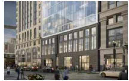
180 W Randolph Hotel mixed-use redevelopment ±0.17 AC CHICAGO, IL