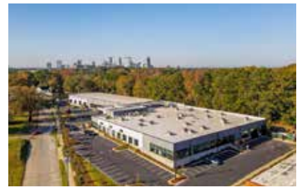
Apple Valley Conversion Industrial to mixed-use adaptive reuse ±3.3 AC ATLANTA, GA