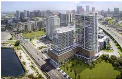
Vela Channelside Phase II Urban high-rise raw land ±0.67 AC TAMPA, FL