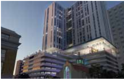
X-Tampa Co-living Urban high-rise mixed-use ±1.01 AC TAMPA, FL