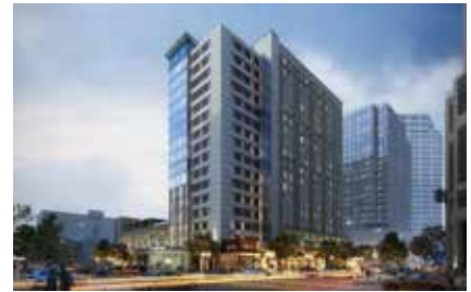
Hyatt Place & Hyatt House Dual-branded hotel development ±1.01 AC TAMPA, FL