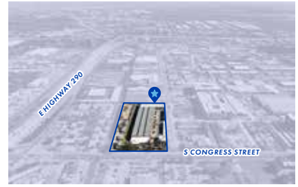
4201 S. Congress Mixed-use redevelopment ±5.52 AC AUSTIN, TX